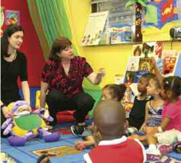
The Teppers and Zoe offer service with a smile as they answer questions at the Prospect Inn day care. ^

To learn more about NYC Service, go to www.nycservice.org .