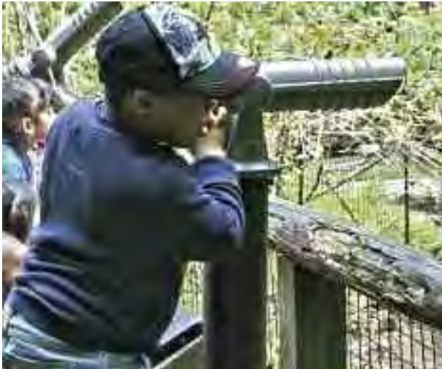
Children from the Saratoga Family Inn enjoyed hand-feeding goats, sheep, and llamas near the barn area. Later at the bird exhibit, they closely examined the attributes of Cuban Amazon parrots, blue-bellied rollers, and helmeted curassows.

Thanks to supporters, summer 2010 for children at the American Family Inns included many adventure-based learning trips. Students of the Brownstone and FutureLink after-school programs discovered anatomy at "Bodies, The Exhibition," and became familiar with animals above and below the water at the Bronx Zoo, the New York Aquarium, and Atlantis Marine World. The children encountered rare plants and flowers at the New York Botanical Garden and explored space and the midnight sky at the American Museum of Natural History. The kids also detected microbes through a microscope at the New York Hall of Science.