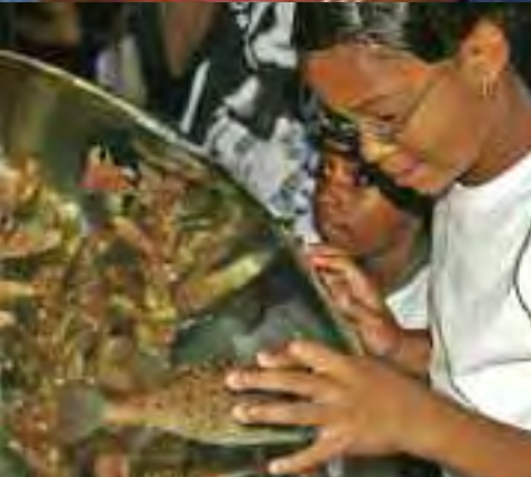
The fish puzzle at the New York Hall of Science was a huge hit with the kids, and at the New York Aquarium, everyone loved the bright colors of the fish from Africa's Lake Malawi.