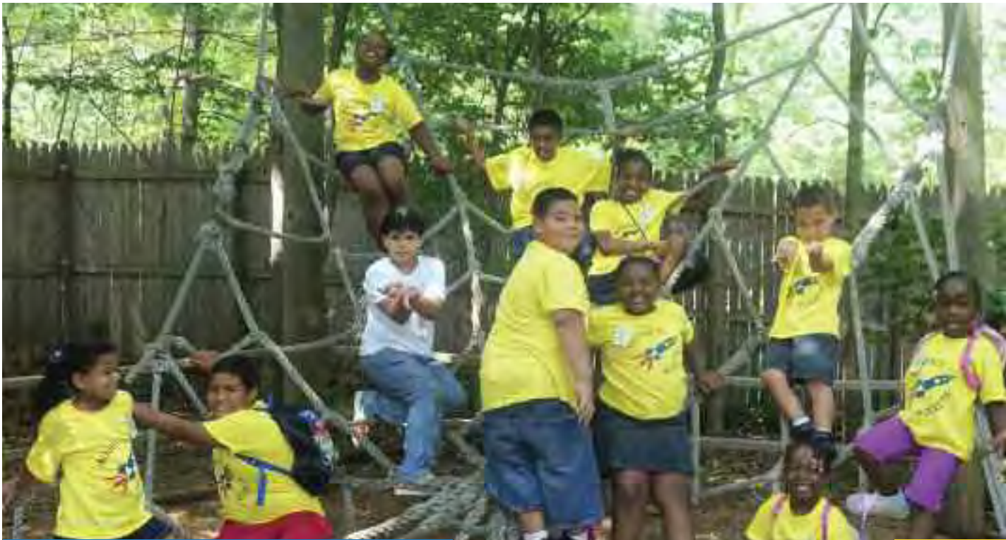
At the Children's Zoo exhibit of the Bronx Zoo, the children mimicked the creatures they saw that day, climbing up a spider web, slithering down a tree slide like lizards, and burrowing through a prairie dog town.

Thanks to supporters, summer 2010 for children at the American Family Inns included many adventure-based learning trips. Students of the Brownstone and FutureLink after-school programs discovered anatomy at "Bodies, The Exhibition," and became familiar with animals above and below the water at the Bronx Zoo, the New York Aquarium, and Atlantis Marine World. The children encountered rare plants and flowers at the New York Botanical Garden and explored space and the midnight sky at the American Museum of Natural History. The kids also detected microbes through a microscope at the New York Hall of Science.